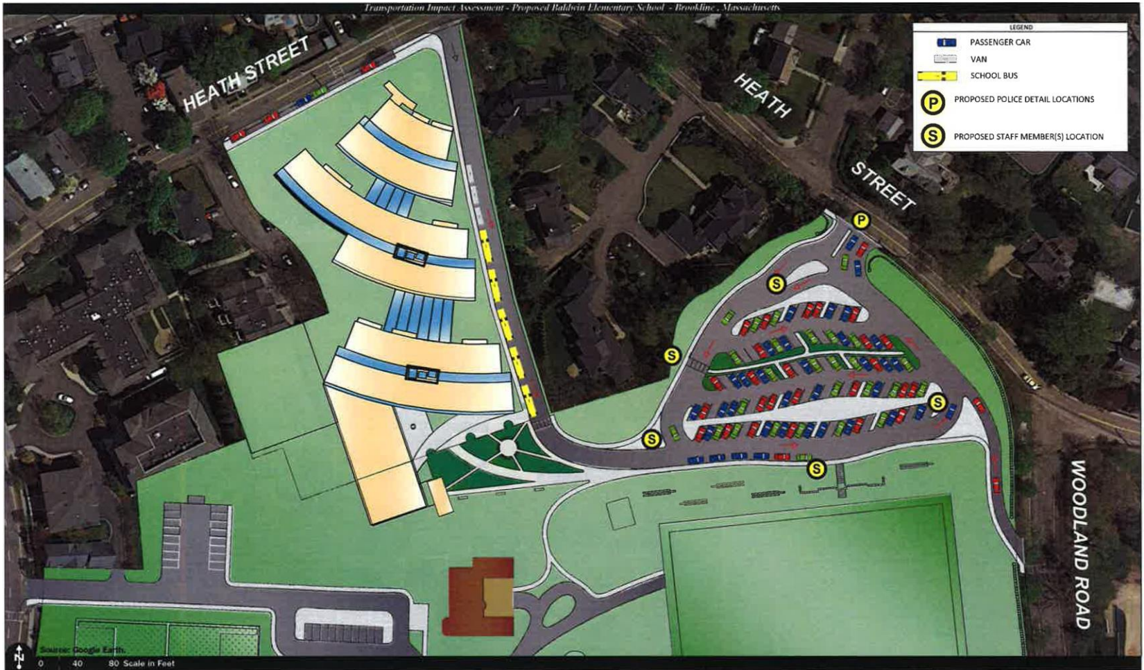
Vehicle Queue Summary Alternative B - 7:35 AM