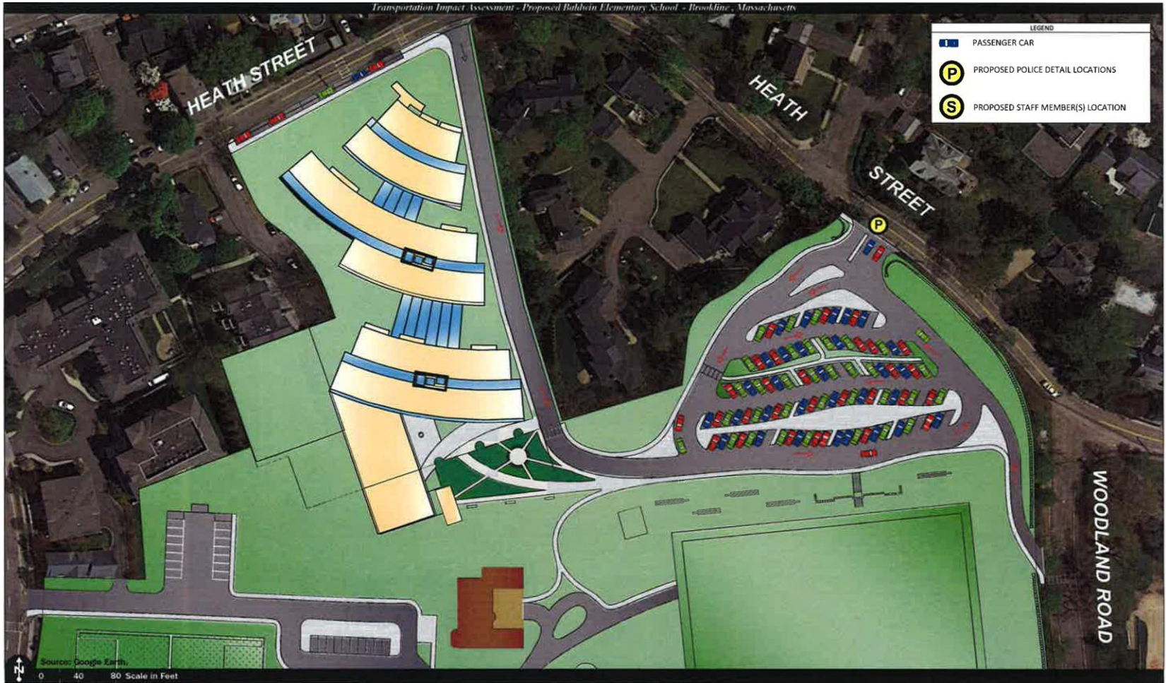
Vehicle Queue Summary Alternative B - 8:10 AM