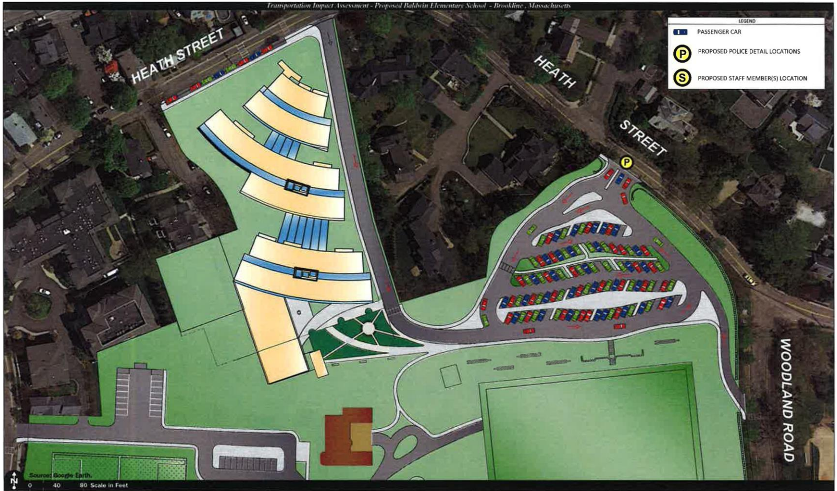
Vehicle Queue Summary Alternative B - 8:00 AM